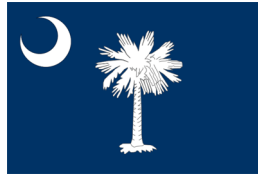
3. South Carolina