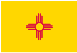
5. New Mexico