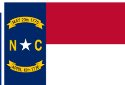
15. North Carolina